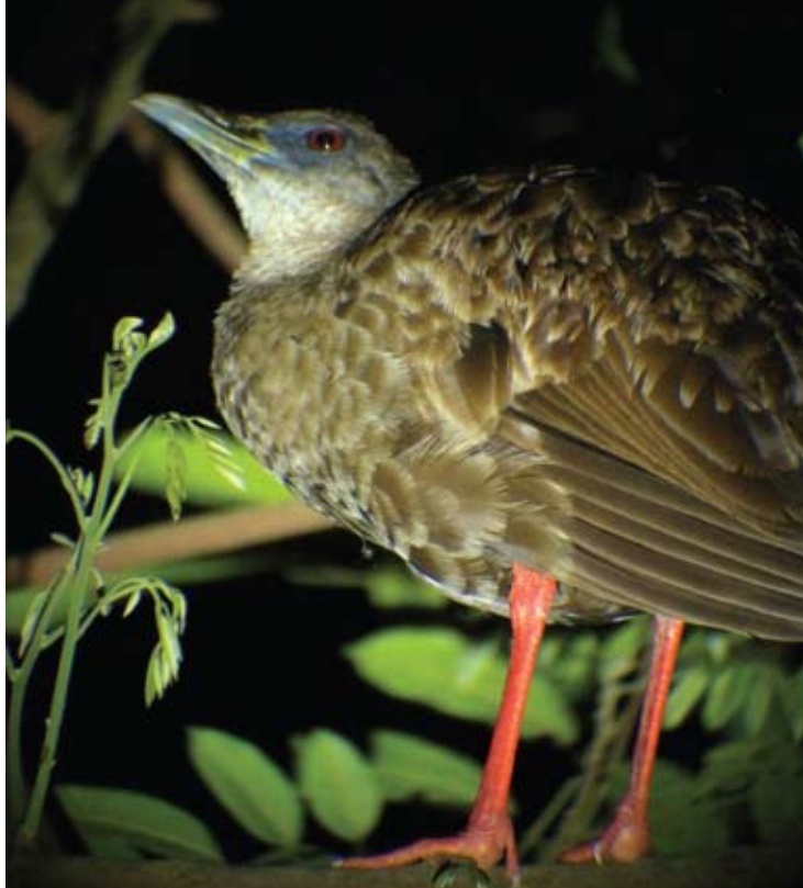
Nkulengu Rail

GHANA - November 2011. We were possibly the first birding tour group in Ghana to ever set eyes on the elusive Nkulengu Rail, a fitting tribute to a tour that also saw Yellow-headed Picathartes, and the rare Hartlaub's Duck (with ducklings). We also enjoyed amazing views of Rosy, Black, and Blue-headed Bee-eaters, Chocolate-backed and African Pygmy Kingfishers, Rufous-sided Broadbill, African Piculet, Red-billed and Black Dwarf Hornbills, Cassin's Hawk-eagle, Red-thighed and Black Sparrowhawks, Fraser's Eagle Owl, and Plain, Black-shouldered, and Long-tailed Nightjars. Our 2012 tour takes place from 3 - 17 November with James Lidster and Robert Ntakor as leaders.